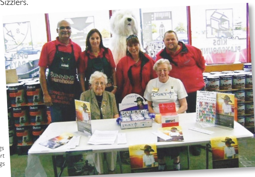
Rockingham Laurel Club with Bunnings staff on badge collection day at Port Kennedy Bunnings